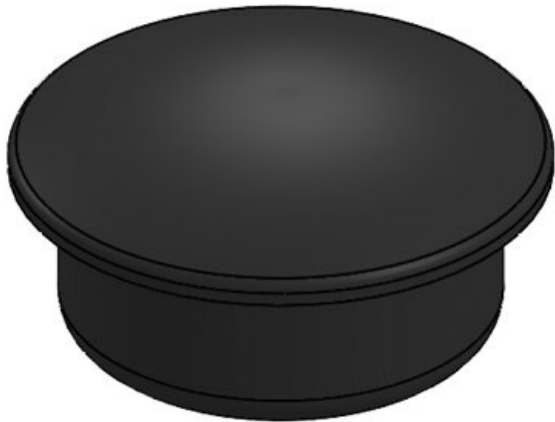
Cover plug A